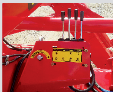
Independent hydraulic controls. Speed Control Valve.