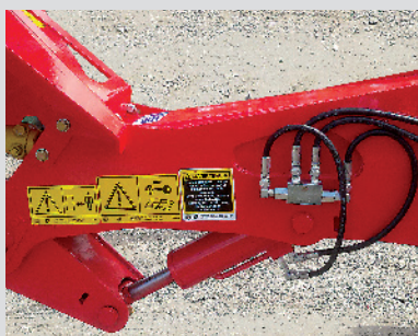
Height adjustment through hydraulic cylinder.