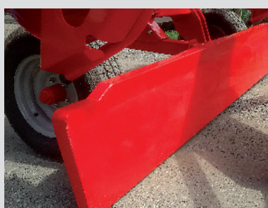
Grain Pusher. It ensures a better end of bag.